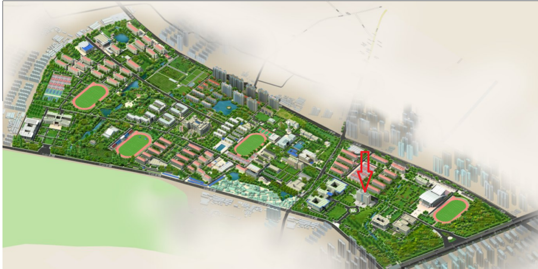
Fig. 2 Location of meeting venue (red arrow) in the NUIST campus