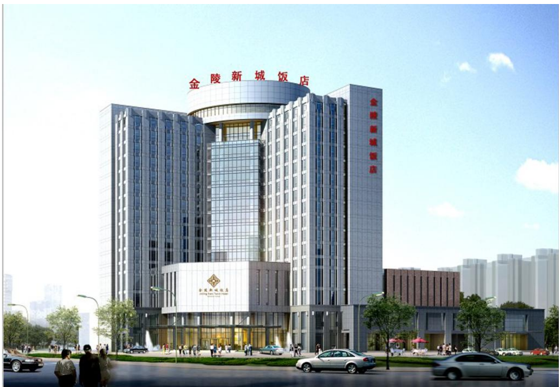
Fig. 4 Jinling New City Hotel Nanjing

The return schedule may be adapted according to the practical activities in each day.