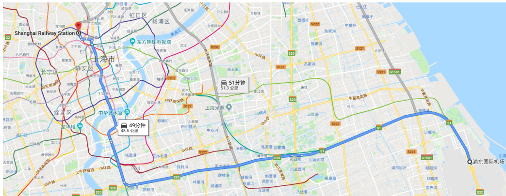
Fig. 3 Connection between Pudong International Airport and Shanghai Railway Station

Second , take the high-speed train from Shanghai Railway Station to Nanjing Railway Station . This trip takes about 1.7 hours. The high-speed train from Shanghai to Nanjing is available every hour from ~ 7:00 to ~22:00.